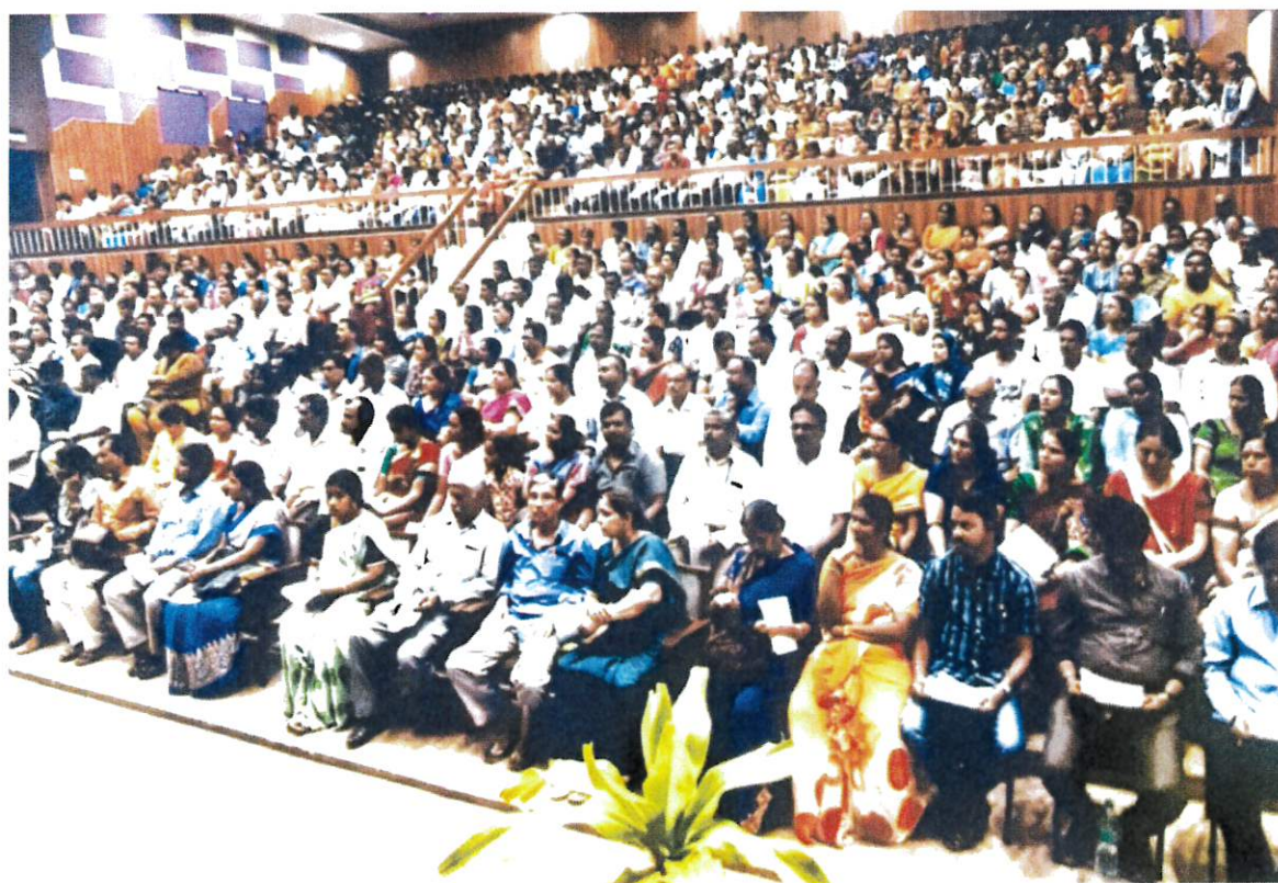
Gathering of first year students and parents

The IQAC, in collaboration with the Department of Physics organized the Orientation programme in the month of June, 2016 on subject matters such as values and ethics, health and hygiene, personality development and industry needs. Feedback regarding the Orientation Programme and the speakers were collected from the students and analyzed by the IQAC