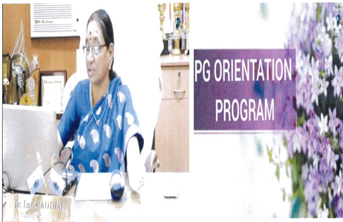
The Principal addressing the Postgraduate Students