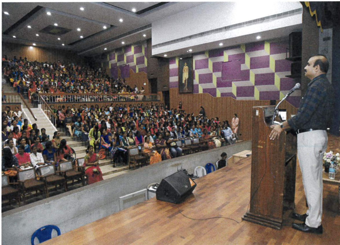
The Chief Guest addressing the gathering

The IQAC, in partnership with the Department of Nutrition & Dietetics organized the Orientation Programme in June 2018 for the students and their parents that covered areas such as campus facilities, quality policies, green initiatives and importance of “learning by doing” . There was great enthusiasm in the atmosphere of the orientation in understanding the practices of the college and ways to mold oneself into the Ethirajian habitude.